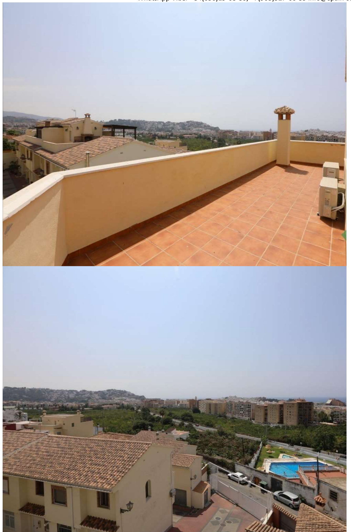
Seaview townhouse in Almunecar http://spain-style.ru/en/catalog/townhouse-almunecar/index.php