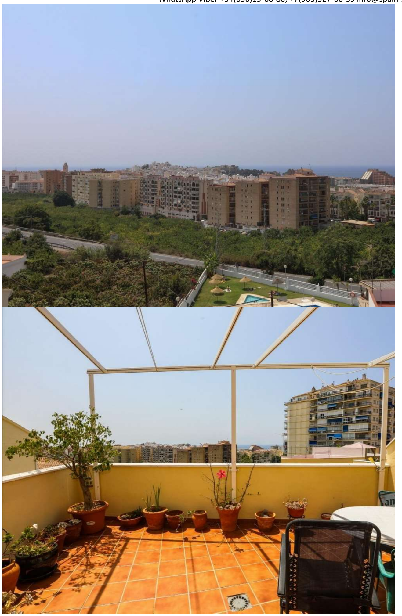
Seaview townhouse in Almunecar http://spain-style.ru/en/catalog/townhouse-almunecar/index.php