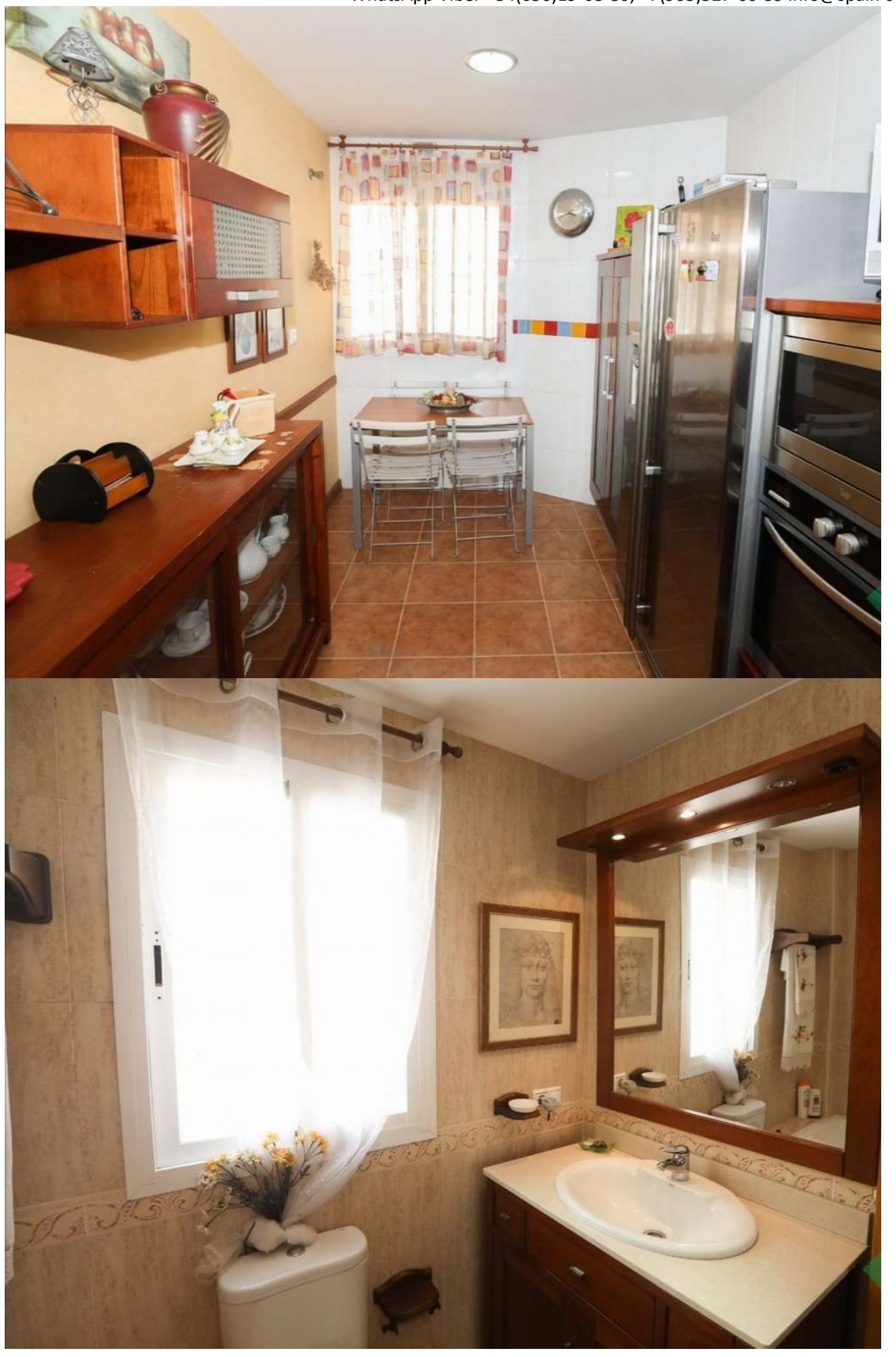
Seaview townhouse in Almunecar http://spain-style.ru/en/catalog/townhouse-almunecar/index.php