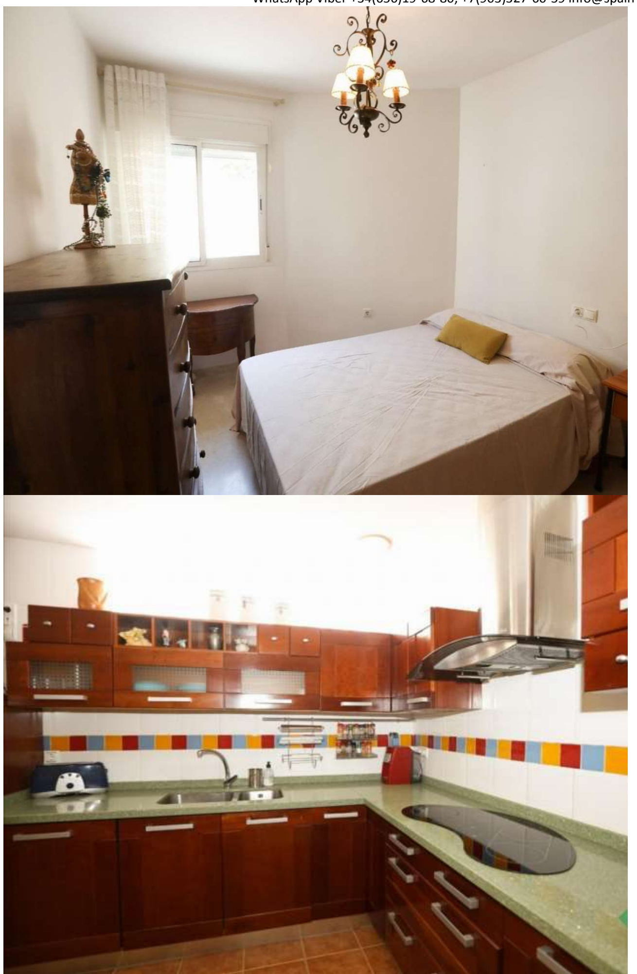
Seaview townhouse in Almunecar http://spain-style.ru/en/catalog/townhouse-almunecar/index.php