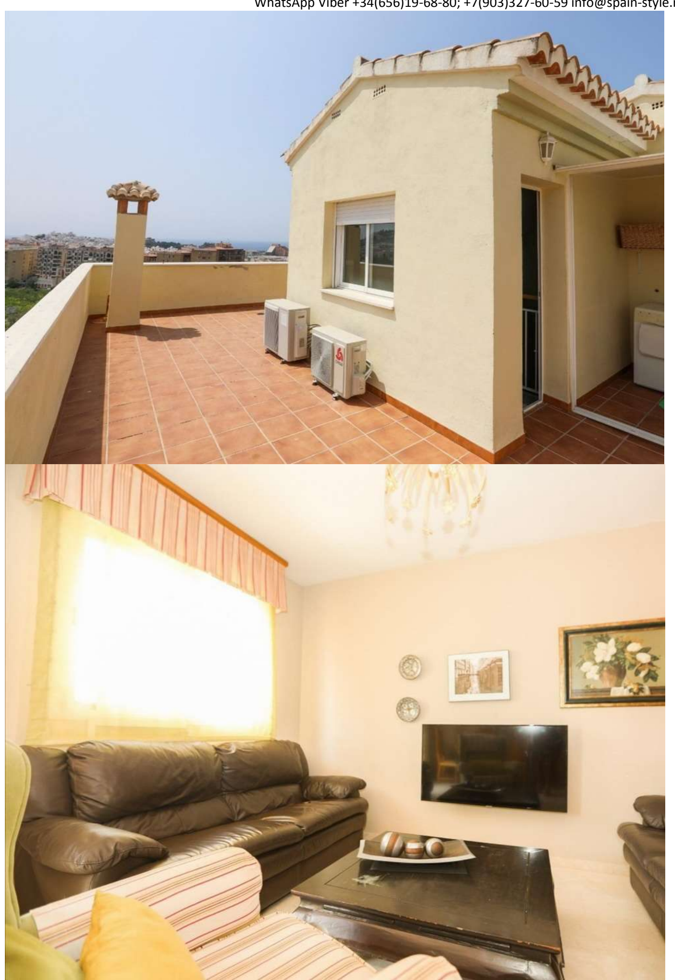
Seaview townhouse in Almunecar http://spain-style.ru/en/catalog/townhouse-almunecar/index.php

Property in Spain - Andalusia spain-style.ru WhatsApp Viber +34(656)19-68-80; +7(903)327-60-59 info@spain-style.ru